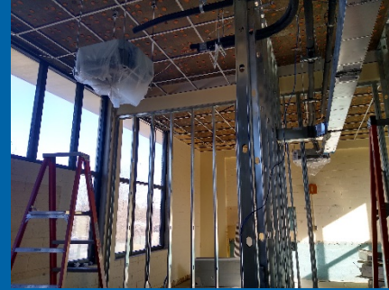
New Framing, Ductwork, and VRF Systems for Offices.