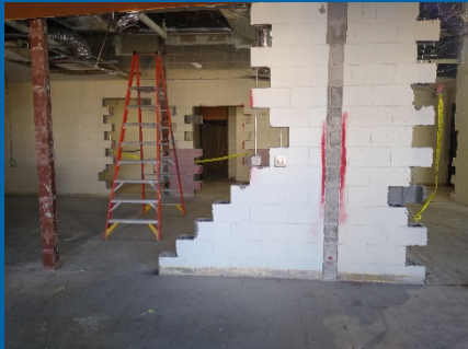
Saw Tooting and Removal of CMU in Media Center.