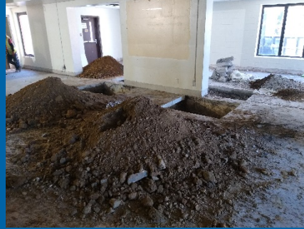
Excavation for New Column Footings in Cafeteria.