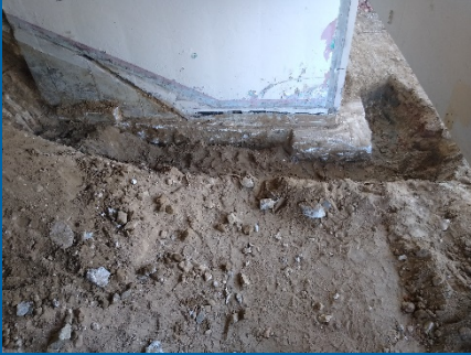
Excavation of Footing at Entrance for Underpinning