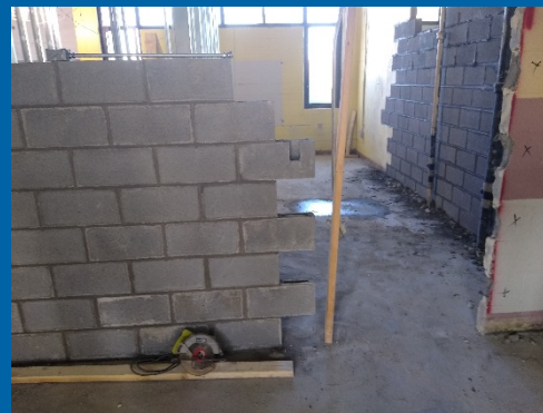
In-fill and Construction of Masonry Walls