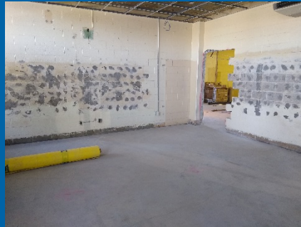
Patching of CMU Walls.