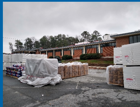
Delivery of Roofing Materials